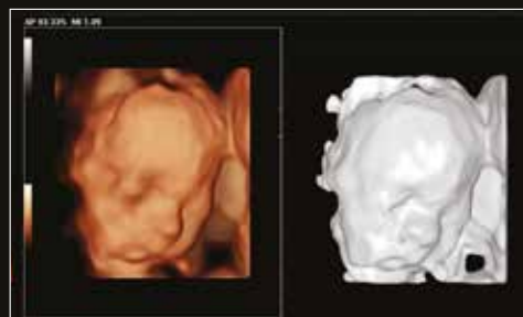
3D Print Format

Experience peace of mind and see something better with Mindray 3D Ultrasound.