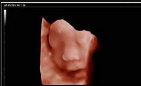
iLive Fetal Face