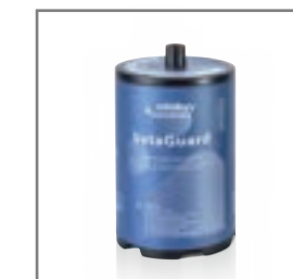
Gas filter canister