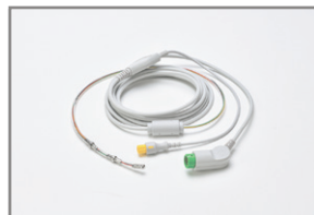
Esophageal probe for ECG & TEMP