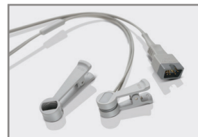
Clip sensor for animal tongue and ear