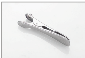
Crocodile clips with comfort soft edge