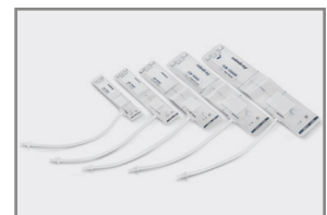
Multi-Size cuffs for different animal sizes