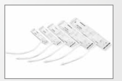
NIBP: Multi-size cuffs for different animals

SpO<sub>2</sub>: Clips for animal tongue and ear