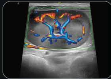
Feline Kidney-Renal Flow