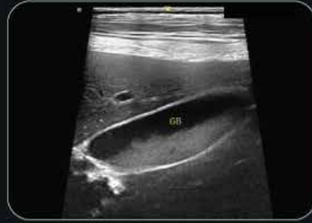
Canine Gall Bladder-Sludge Deposition