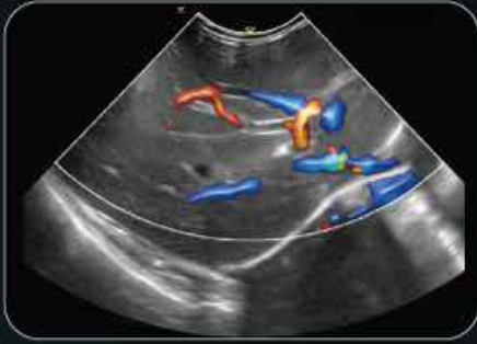
Canine Liver-Hepatic Blood Flow