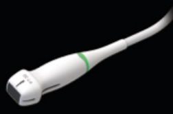
3 - 7 MHz Pediatric Phased Array