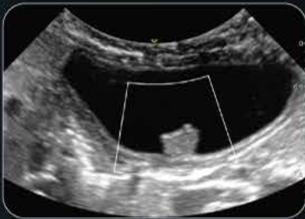
Canine Urology-Bladder Polyp